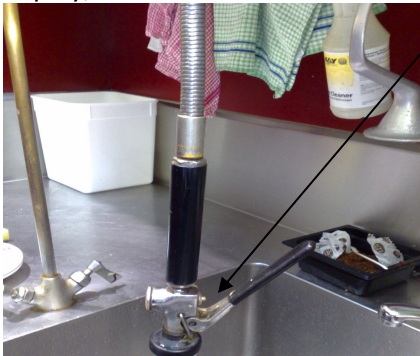
A FISHER spray gun after Many years of use. (approx. 8 yrs)