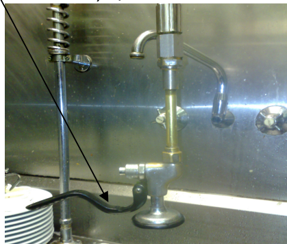
A competitors spray gun after many years of use. (approx. 5 yrs)

Photos from two busy coffee shops in Brisbane.