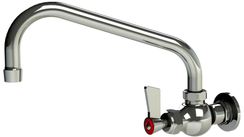
12" Spout Pt. No. :- GS11G3012S

5 sizes of Gooseneck Spouts also Available