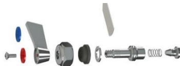
SINGLE Wall Tap Service Kit