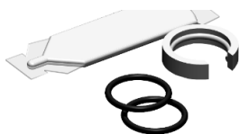
Spout Service Kit

CROSS HANDLE is available - . All handles on these S/S Taps are a chrome plated cast alloy and may have issue if exposed to some aggressive environments. Replacements available